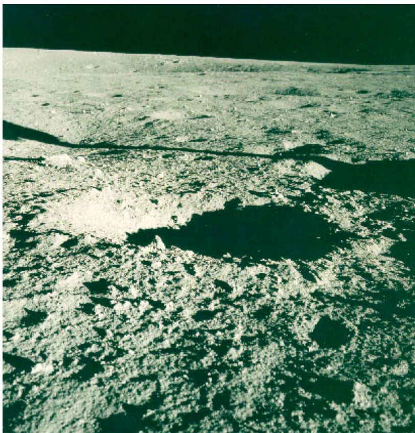
Figure 57 - Meter-size craters in the lunar regolith are capable of producing soil breccias like 15299. Many were lined with glass in the bottom. Fresh craters 10 m and larger are required to dig up hand specimens from the bedrock.