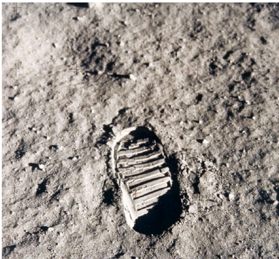
Figure 54 – Footprint in lunar soil. Few rocks are sitting out on top of mature regolith.